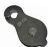
16kN Steel Pulley