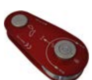
40kN AL Pulley