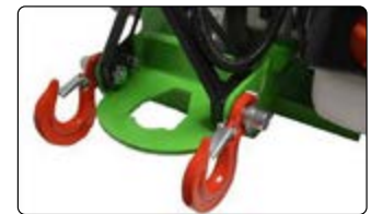
Hook or Tow-Ball Attachment