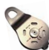
16kN Steel Pulley