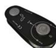
40kN AL Pulley