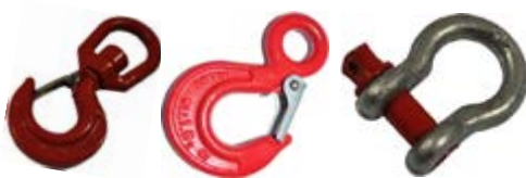
Rated Hooks and Shackles