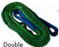
Double Ended Sling