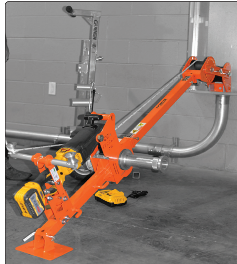
Fully Self Contained Unit