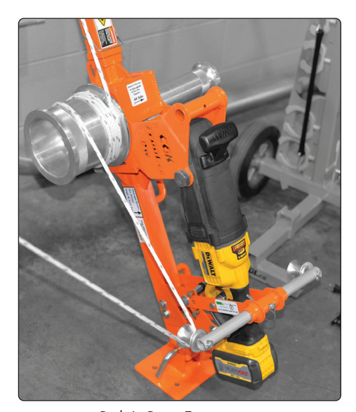
Built-In Rope Engagement