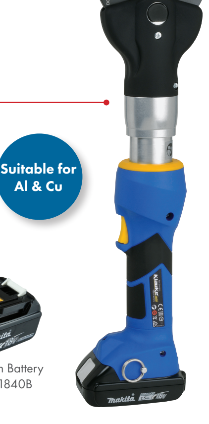
Makita 4.0Ah Battery Part No.BL1840B