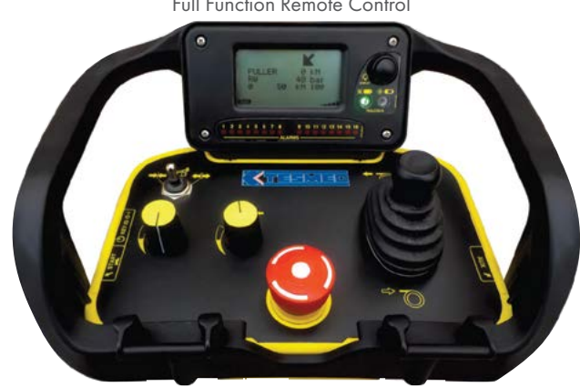
Full Function Remote Control

Pullers equipped with reel-winders feature automatic back-pull control for optimal performance and simple operation.