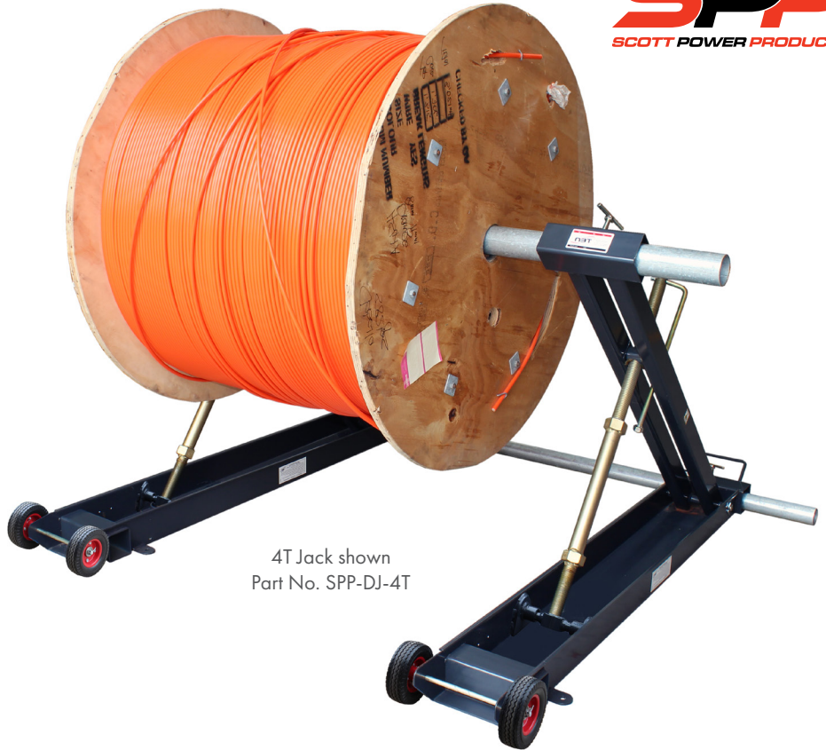
4T Jack shown Part No. SPP-DJ-4T