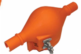
C406-0557 300mm Insulator Cover (150mm length also available)