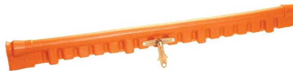
C406-0181 GA with Grip-All Adapter

Conductor covers are 5 feet long and are available with a Grip-All adapter for hot stick application or without adapter for rubber glove application.