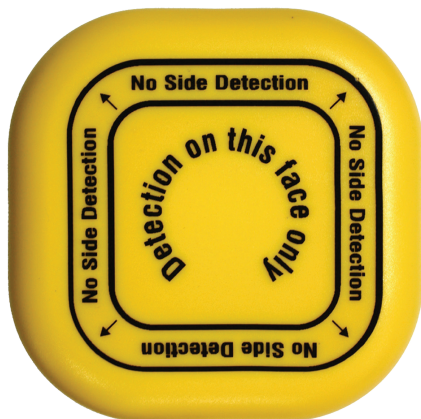
LT220 Detection Face