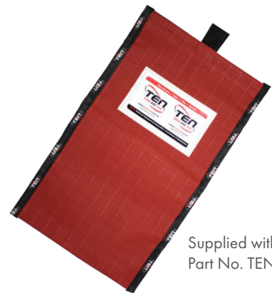
Supplied with bag Part No. TENM445

Static Discriminator - Ignores electric fields not generated by a mains source such as Powerlines