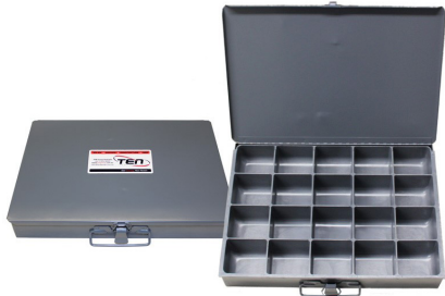
20 Compartment Metal Die Box Part No. 54439-A

12 Tonne Die Kits available Contact TEN for further information