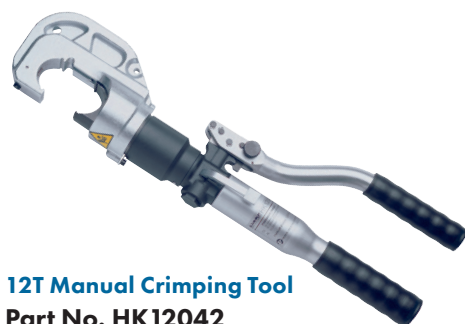
12T Manual Crimping Tool Part No. HK12042