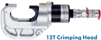
12T Crimping Head Part No. PK12042FPC

Suitable for all brands of 12T battery, manual and remote head hydraulic compression tools & adaptors