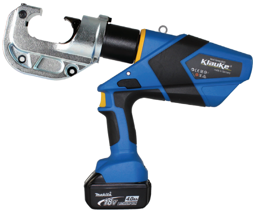
12T Crimping Tool Part No. EK12042CFM