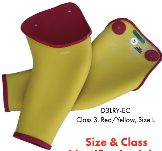
D3LRY-EC Class 3, Red/Yellow, Size L

Size & Class identification label on sleeves