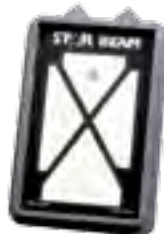
Wireless Control Standard