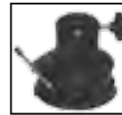
Option - Suction / Magnetic Base