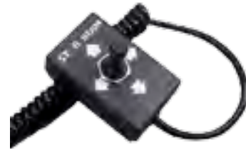
Optional Hard Wired Control