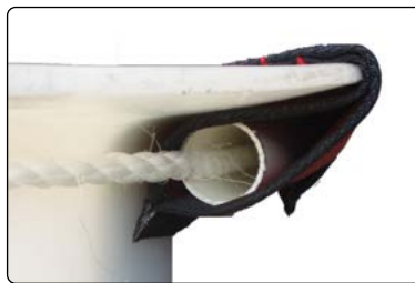
Conduit/Rope shown applied to liner (Included in TENM418)