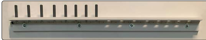
Store Loose Sockets or Sockets with 7/16 adapters