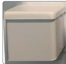
Water tight box for Sensitive Equipment