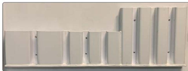
Open storage for Shifters, Screwdrivers and Hammer etc.