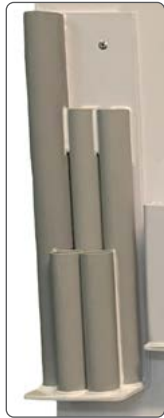
Stores Podger Stick, Cable Ties & Auger Bits