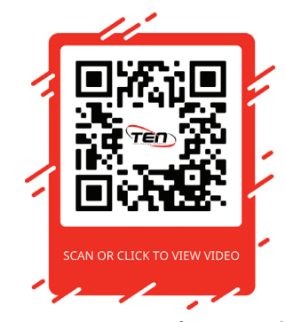
SCAN or CLICK for Hot Stick Cleaning Instructions

References: ASTM F711, OSHA, Hastings, Polywater