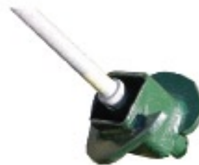
Cat. No. DTX-64-M24