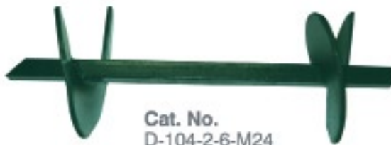
Cat. No. D-104-2-6-M24

DIXIE TOUGH HIGH STRENGTH ANCHOR Torque 13.6KNm tapped m24