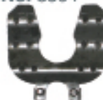
Clevis type RIV Shunt